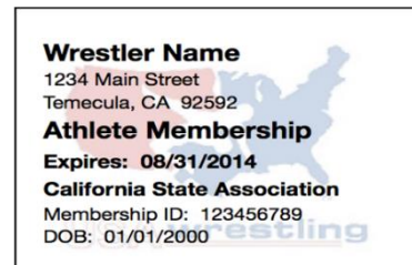
Example of USA card